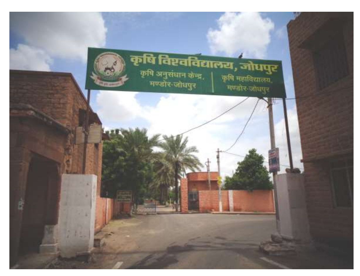
Agriculture University Jodhpur Gate